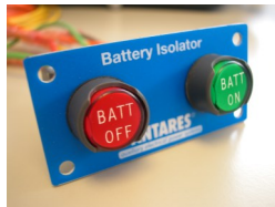
manual isolator switch

In applications with an on board charger, the system will remain active whilst the voltage remains above the cutoff threshold. This feature eliminates unnecessary discharge when the vehicle is parked and not in use. Conserving charge will improve battery life and give operational cost savings. The automatic isolation is indicated by a flashing indicator switch. Once disconnected the system draws negligible current, it can be reactivated simply by pressing the conveniently located dashboard switch.