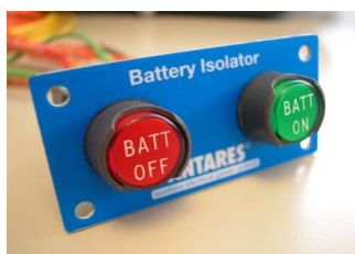
manual isolator switch

When isolated the isolator switch blinks and is pressed to reconnect the loads.