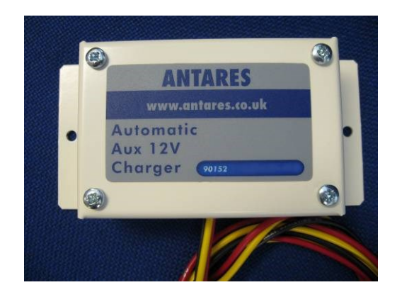
Approved condition for use : On-board road going vehicles

12V AUXILIARIES TOP-UP CHARGER + INTEGRAL SPLIT CHARGE